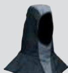
16 91 00