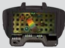
40 00 85