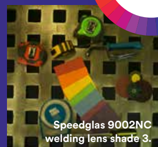
Speedglas 9002NC welding lens shade 3.

Ph: 0800 699 353 sales@prolinewelding.com