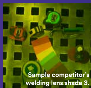
Sample competitor's welding lens shade 3.