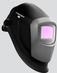
40 13 85