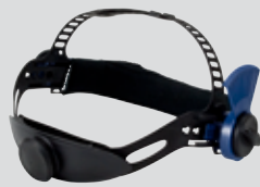
70 50 15